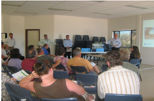
Binningup Community Forum, 21 February 2008