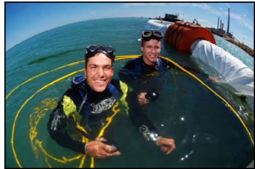
Perth Seawater Desalination Plant

If so, please contact the Water Corporation before 25 April 2008 for further information.