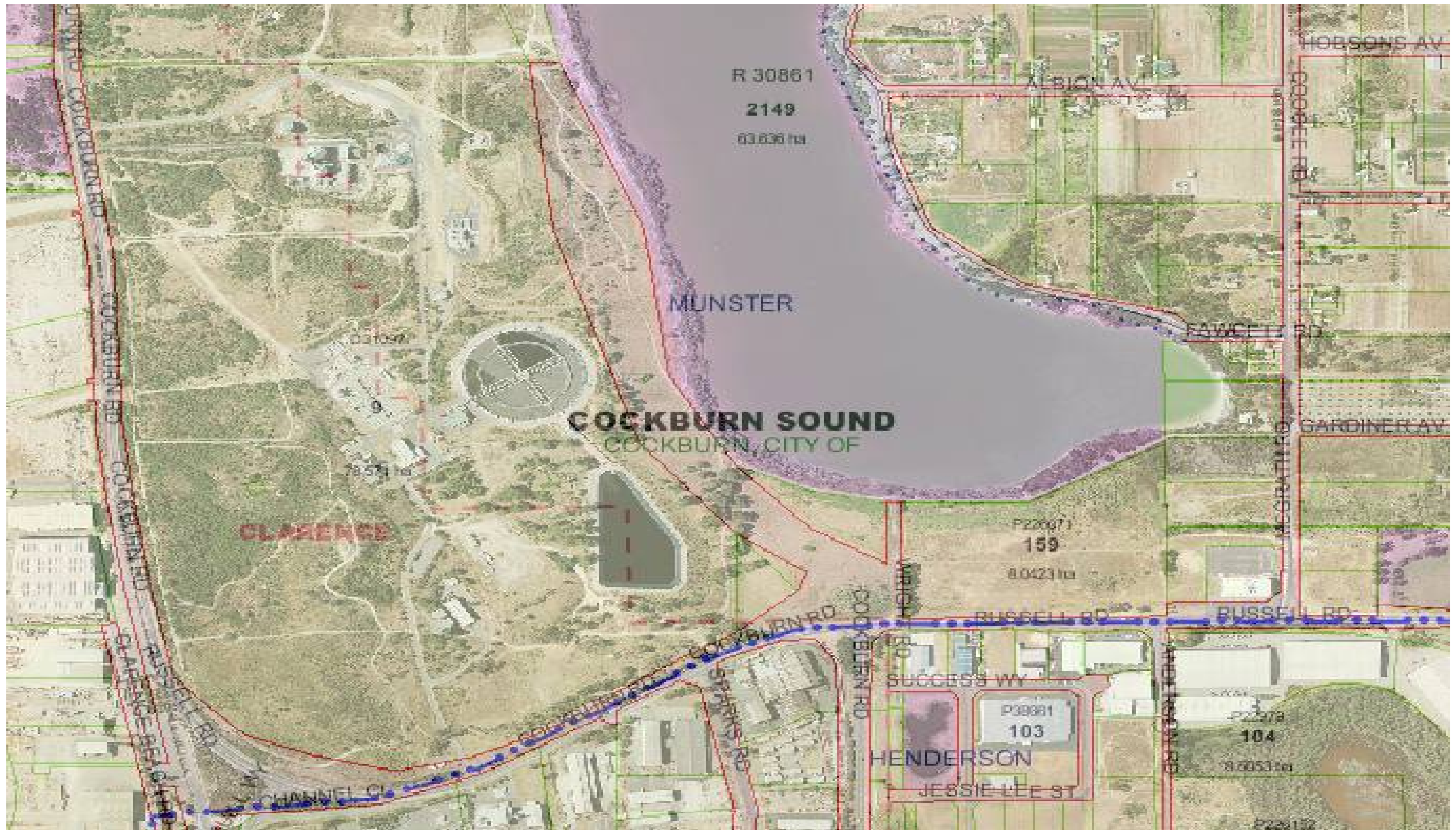
APPENDIX 1: Figure 1 Locality Map