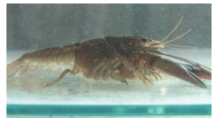
Pictures of a Black fly larva, Caddis fly larva and a gilgie identified as part of the research project.